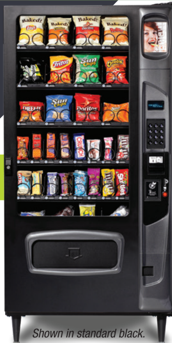
Shown in standard black.