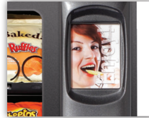
Back lighted point of sale window for advertising and specials.