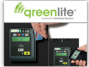
Credit/Debit & mobile reader options.