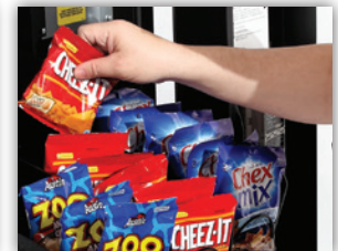
Dispenses All Brand Name Products

Keeps customers satisfied and reduces service calls for misloaded product.