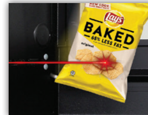
iVend® Guaranteed Delivery System

Keeps customers satisfied and reduces service calls for misloaded product.