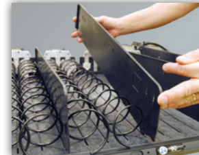
Re-configure trays to almost any package size in the field with no need for tools.